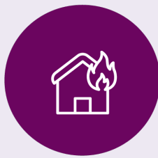
Figure 1.1 – Comprehensive Fire Safety

CSS are a connected framework with Prevent, Detect, and Contain programs, processes, and people. Together they help students and teachers to identify and respond to individuals before the issues or concerns escalate into a crisis.